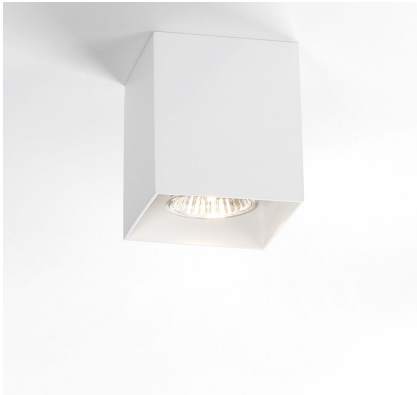
BOX 20 C