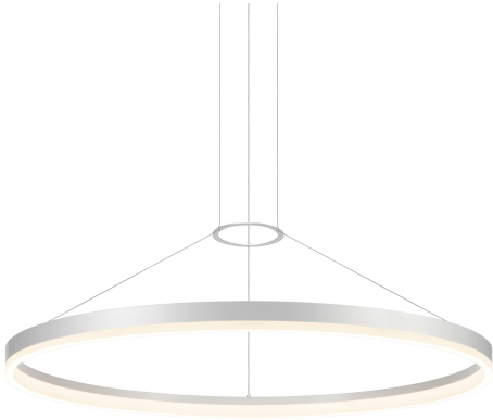
SLIM RING 800 P