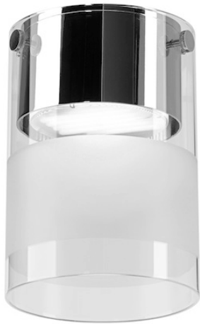
VESSEL GLASS CEILING